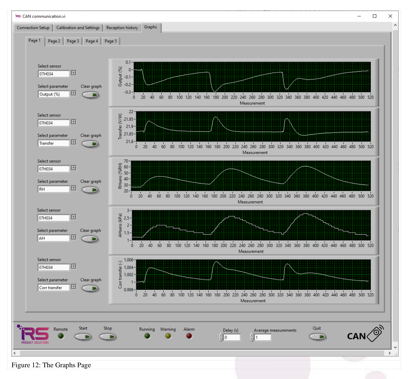
Fig. 12. shows several data of sensor 07H034: output (%), Transfer (V/W), RH (%RH), AH (kPa) and Corrected transfer (-), for some 520 measurements. The graph shows the effect of breathing in and out over the XEN-5320 CAN.

There are 5 pages with displays and each page has 5 displays per sub-page. Each display can show one parameter from one sensor. So it is possible to use 5 displays to show 5 parameters from 1 sensor, but it is also possible to use 5 displays to show 1 parameter of 5 sensors.